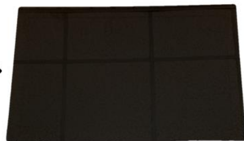
Black panel effect