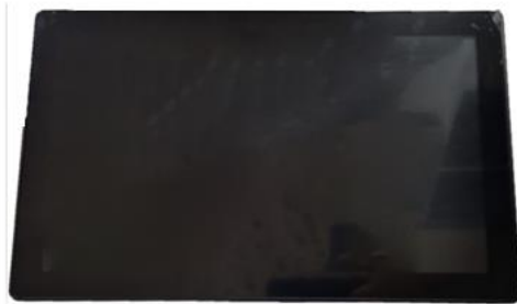
Non-black panel effect